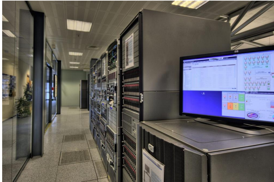
Figure 2: HP hardware powered by Intel® Xeon® processors